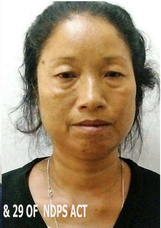
CONVICTED U/S 22 (C) & 29 OF NDPS ACT