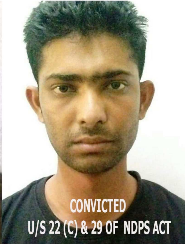
CONVICTED U/S 22 (C) & 29 OF NDPS ACT