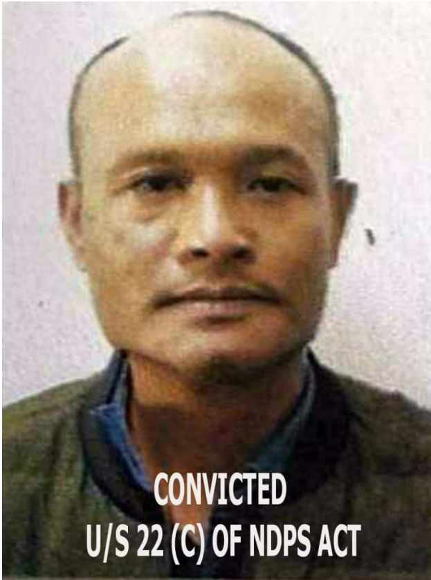
CONVICTED U/S 22 (C) OF NDPS ACT